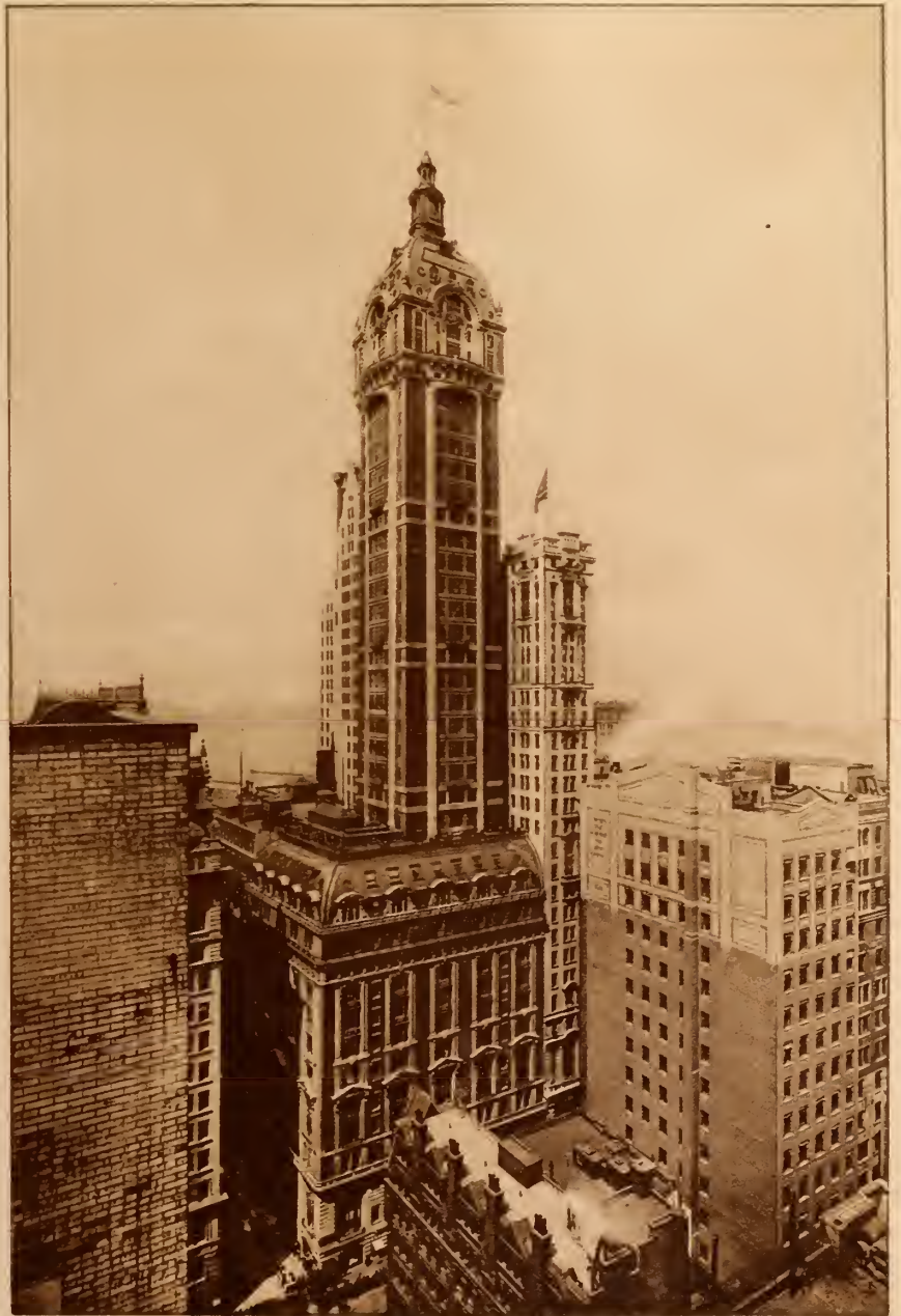
SINGER BUILDING, corner Liberty Street and Broadway. 49 stories and 724 feet high from basement to flagstaff. Exterior illuminated by searchlights.